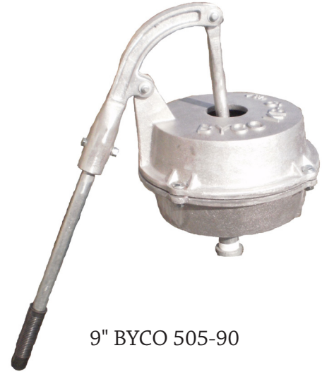
9" BYCO 505-90

MADE IN U.S.A. Field proven for over 30 years. Manufactured from time tested materials.