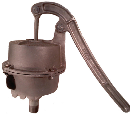
6" BYCO 502-60